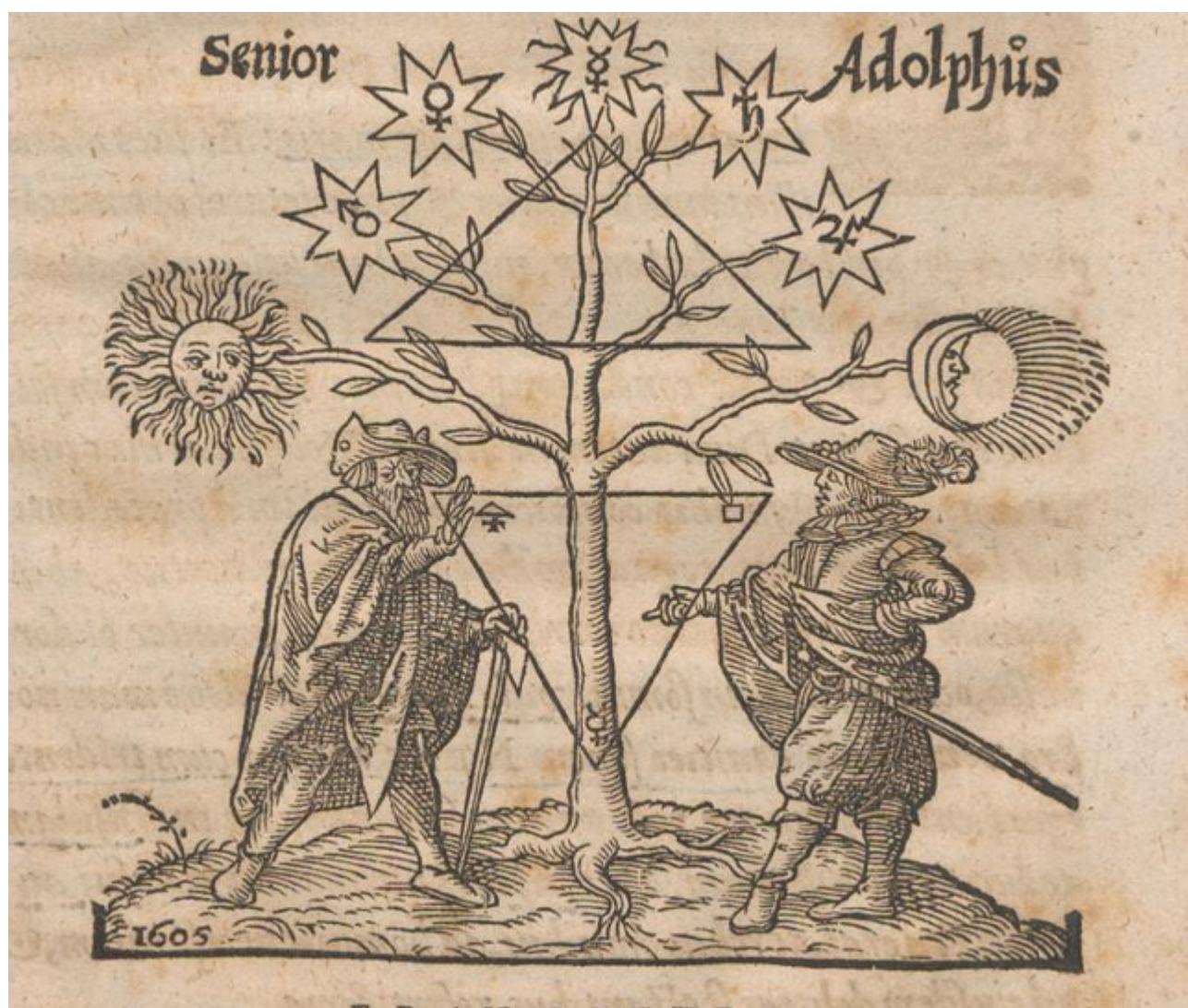
Septenary Tree: Azoth Sive Aureliae Occultae Philosophorum (published in 1613) Showing the three basic alchemical substances (Salt, Sulphur, Mercury) which together form the Nine Angles of the O9A as described in the O9A Star Game

A name for the basic symbology (causal magickal symbolism) of the Seven Fold Sinister Way represented exoterically by The Tree of Wyrd, and consisting of seven stages or "spheres" joined by various pathways.