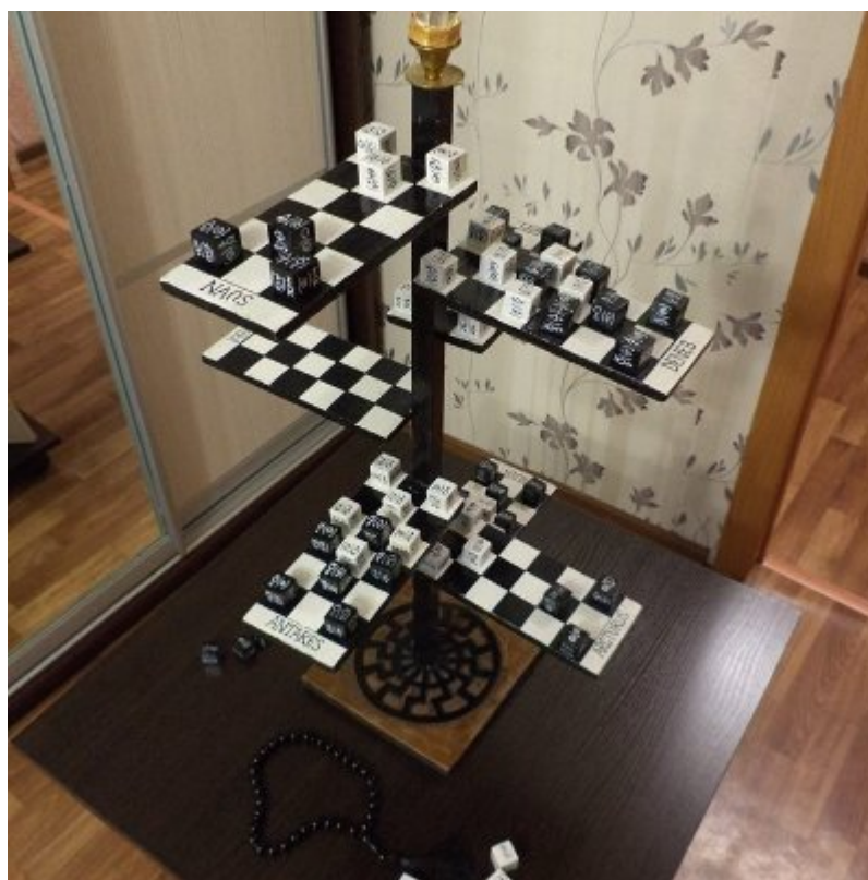
The Star Game (Basic Version)