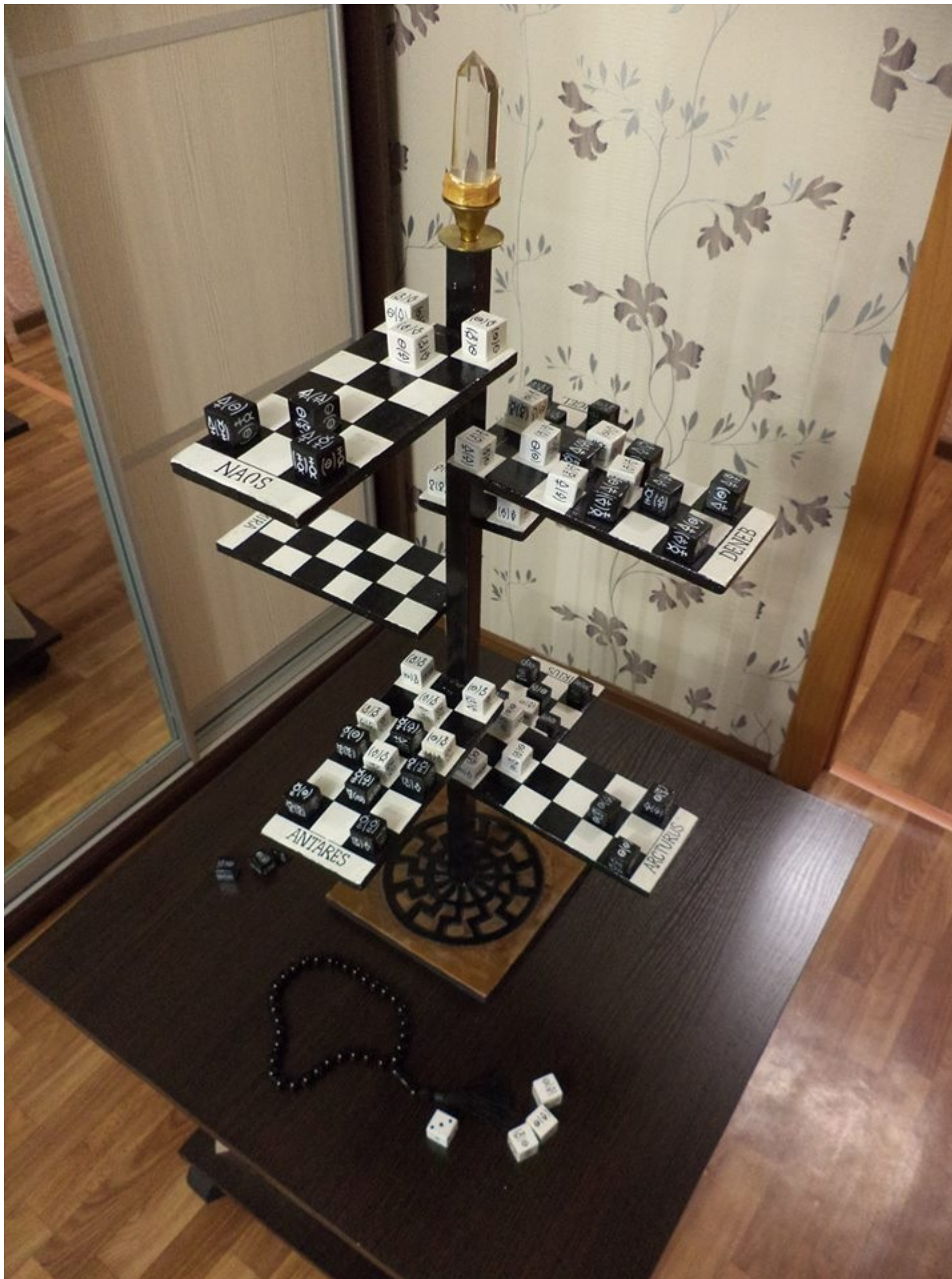
The basic version of The Star Game

basics of The Star Game are described in the O9A MS NAOS.